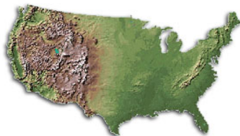
United States Chapters